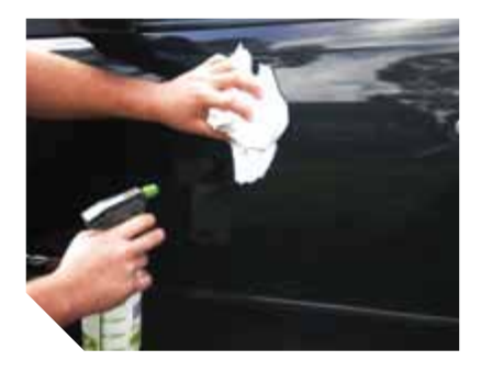
The surface of the vehicle & surface of the magnet must be clean and dry.