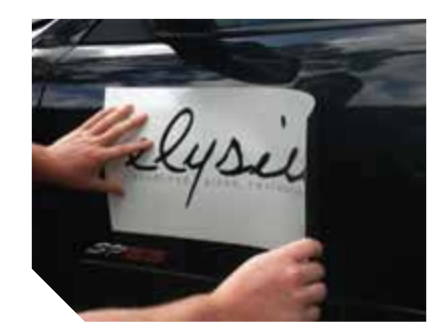
Apply magnetic sheet directly to the vehicle. Do not pull magnet to reposition